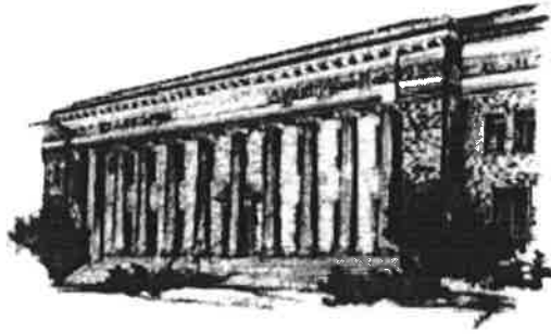
Tehama County Courthouse